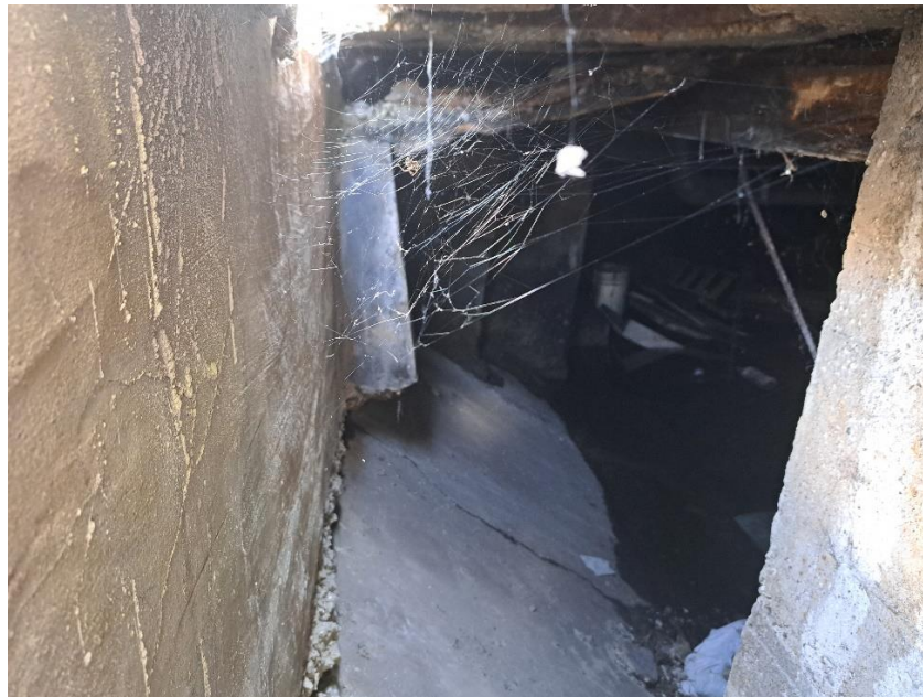
190 th E. 154 th Street (South Vaulted Sidewalk Area)