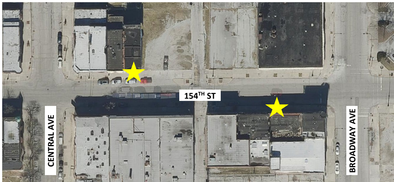
PROJECT LOCATION MAP (Downtown City of Harvey, IL)