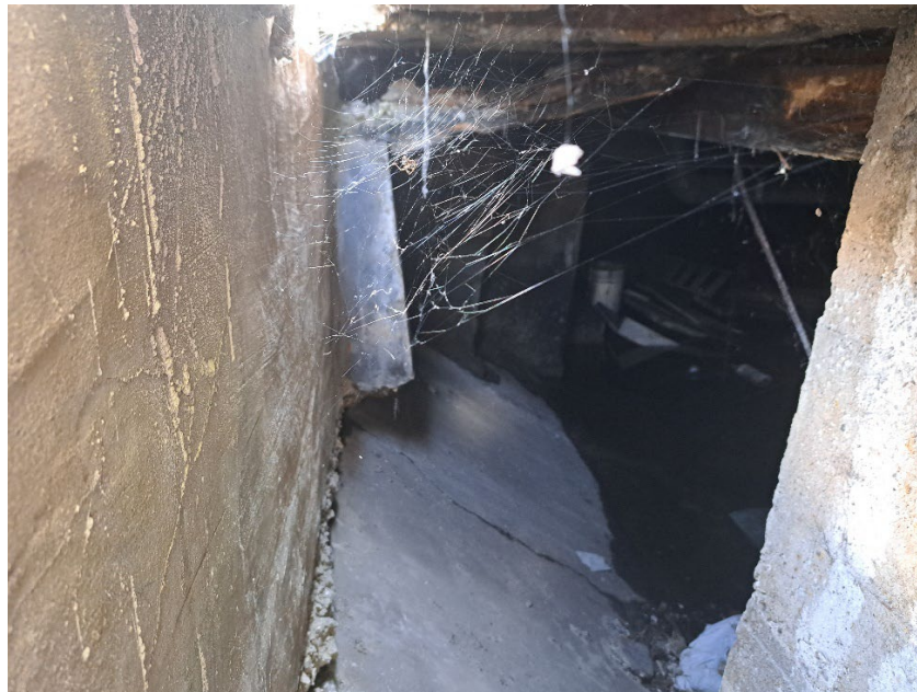
190 th E. 154 th Street (South Vaulted Sidewalk Area)