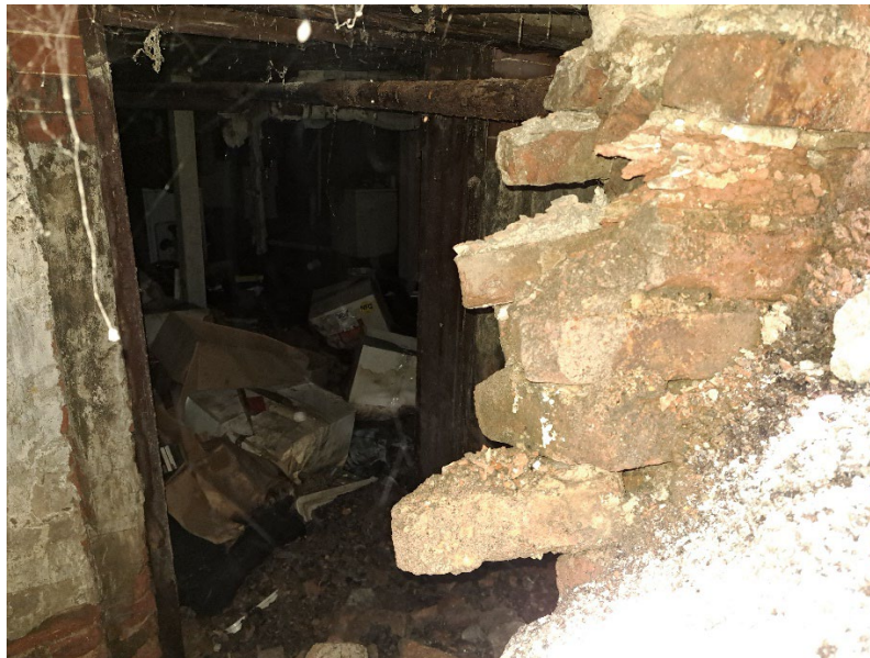
175 th E. 154 th Street (North Vaulted Sidewalk Area)